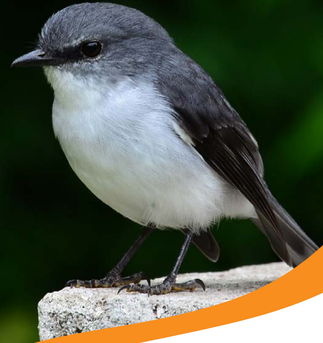
White-breasted Robin